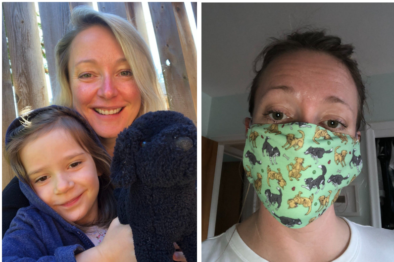
My little one and I and then here I am with a dog mask